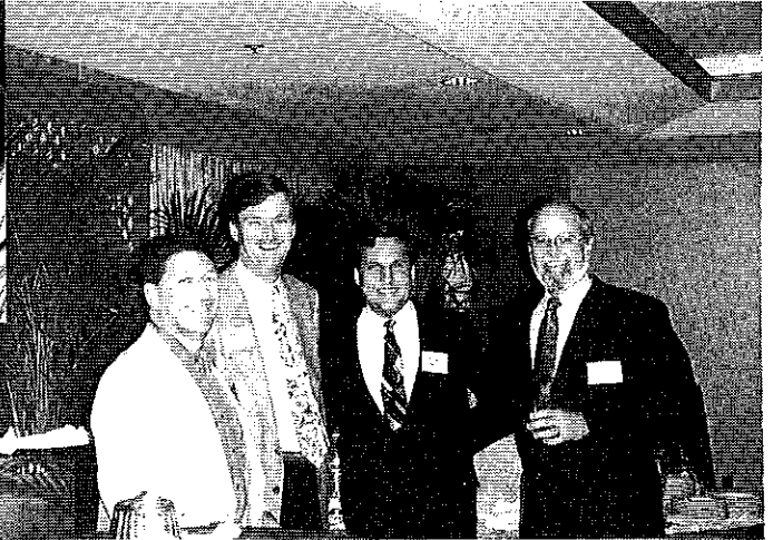
The Cocktail Party Was A Place To Meet & Greet