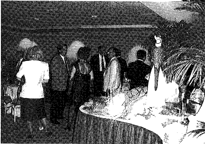
Fun Was Had By All At The Cocktail Party